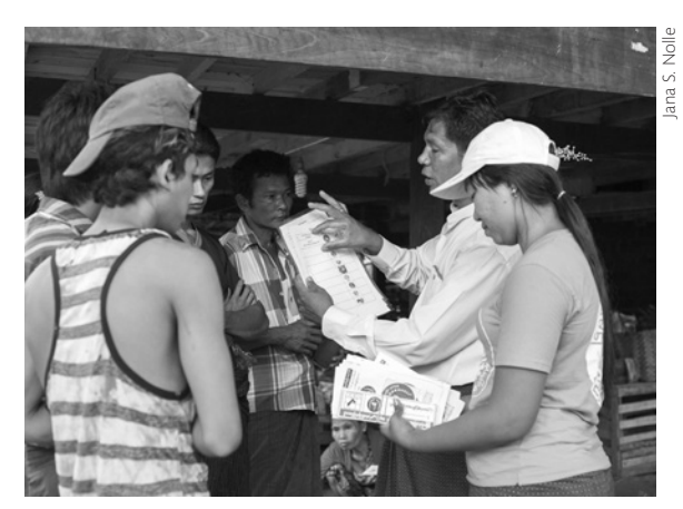
Union Solidarity and Development Party campaigners go door to door in Bago region showing sample ballots and explaining voting procedures.

An unprecedented collective voter education effort was launched across Myanmar by a large number of civil society groups, both national and locally based, many of which were recently formed and lacked experience. The energy was notable, as was the number and range of the civil society actors involved, including many ethnic minority organizations and networks. They disseminated posters, pamphlets, and other publicity materials produced by the UEC and partner organizations and delivered their own training workshops in wards and villages. Carter Center observers found