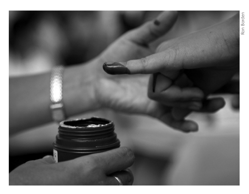
A voter's finger is inked at a polling station in Yangon in order to prevent multiple voting.

Voter slips helped facilitate the voting process, including aiding voters in finding their names on the voter list. However, there were instances where polling station staff did not understand that the slips were not mandatory. Observers received reports at 13 polling stations about voters being turned away for not having a voter slip. Similarly, there were several polling stations where voters were turned away because staff were not aware of provisions allowing for a third party to vouch for the identity of voters without identification.