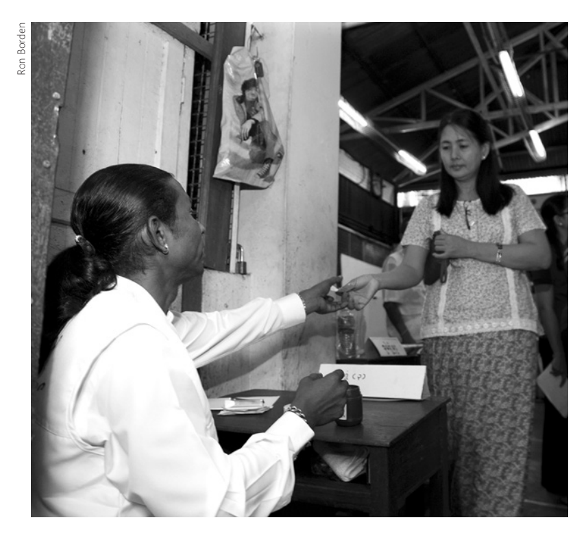
47 See Myanmar Information Management Unit, Map of Transferred Votes in the 2015 Elections, at www.themimu.info/sites/themimu.info/files/documents/18-Sector_Map_Gov_IFES_Pyithu_Hluttaw-Transferred_Votes_MIMU1363v01_11Jan16_A3.pdf.

A voter hands her voter slip to a polling officer for verification.