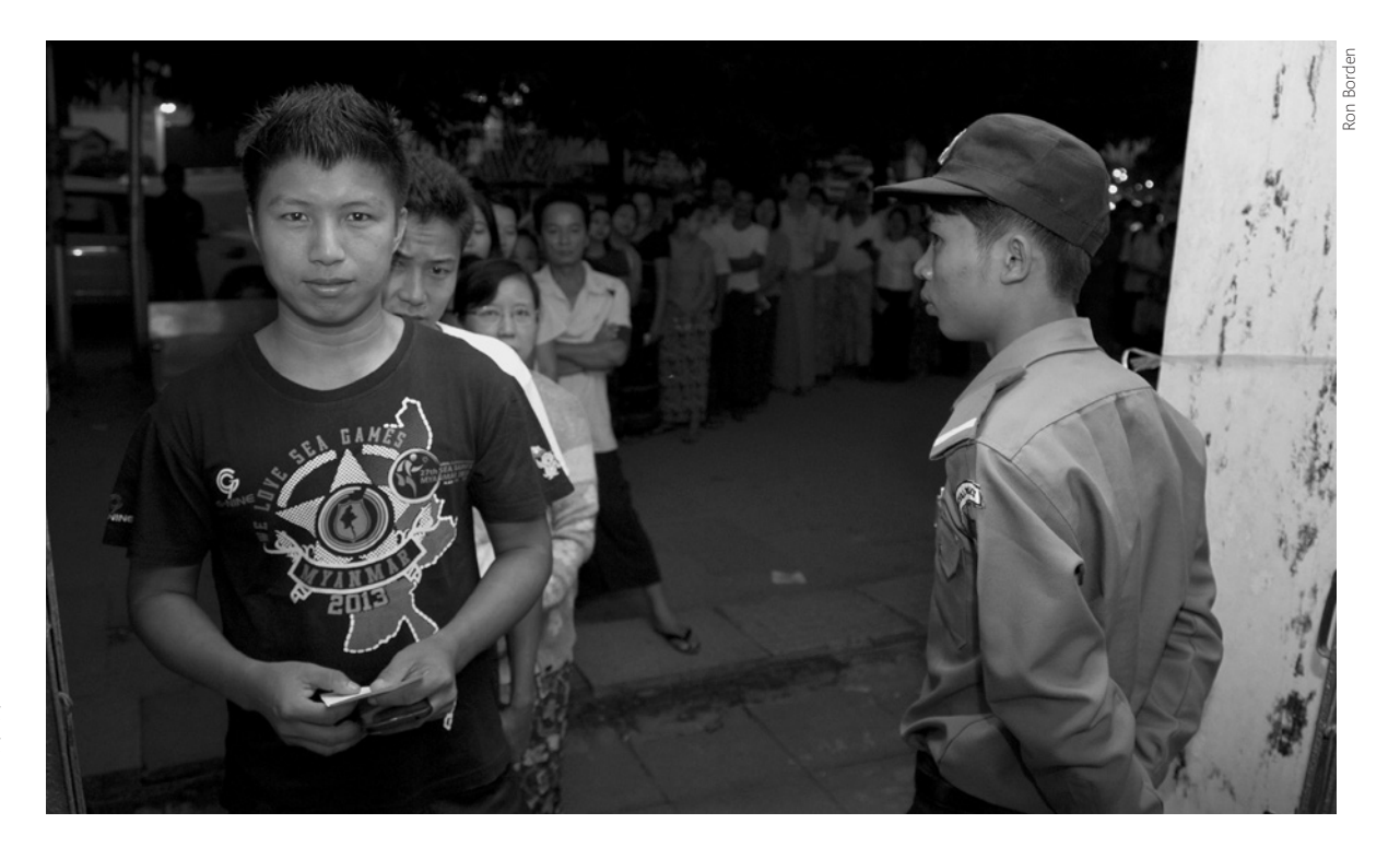
Voters queue in the early morning before the polling station opens in Yangon.

Opening. Polling staff members arrived at polling stations to prepare before doors opened at 6 a.m. on election day. Opening procedures involved setting up the polling station and filling out protocols to verify that all materials had been