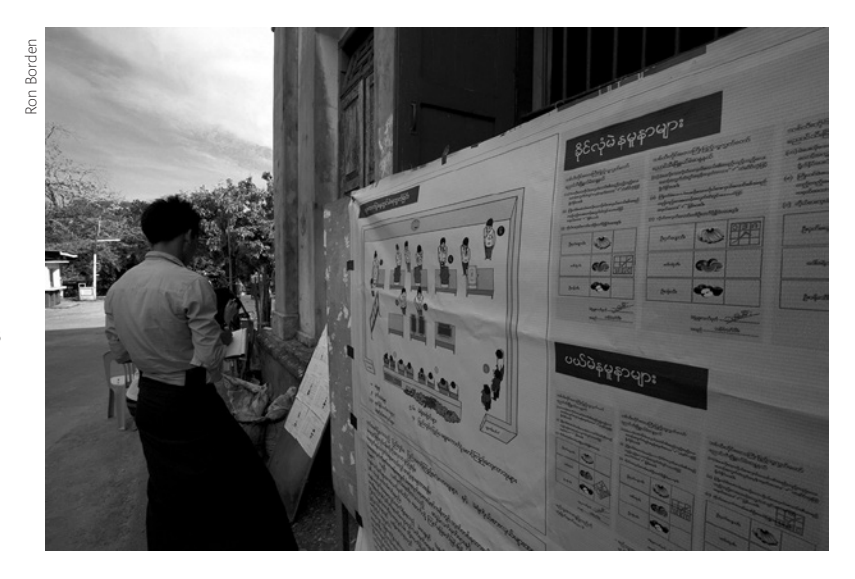
87 Article 364 of the 2008 constitution states, "The abuse of religion for political purposes is forbidden," and Article 58(c) of the election laws states that it is impermissible to urge anyone to vote or not vote on religious grounds.

Posters showing voting procedure are displayed outside a polling station in Yangon.